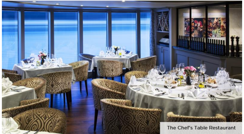
The Chef's Table Restaurant