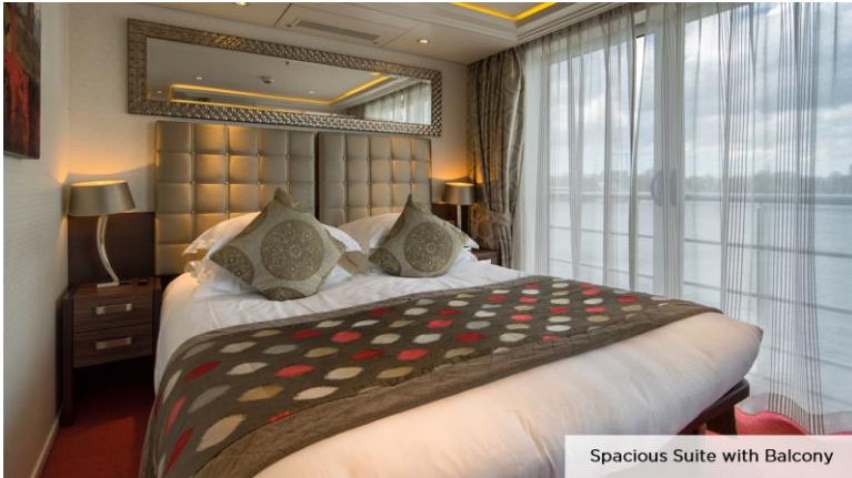
Spacious Suite with Balcony

7-night cruise | October 7-14, 2026 | Aboard AmaPrima