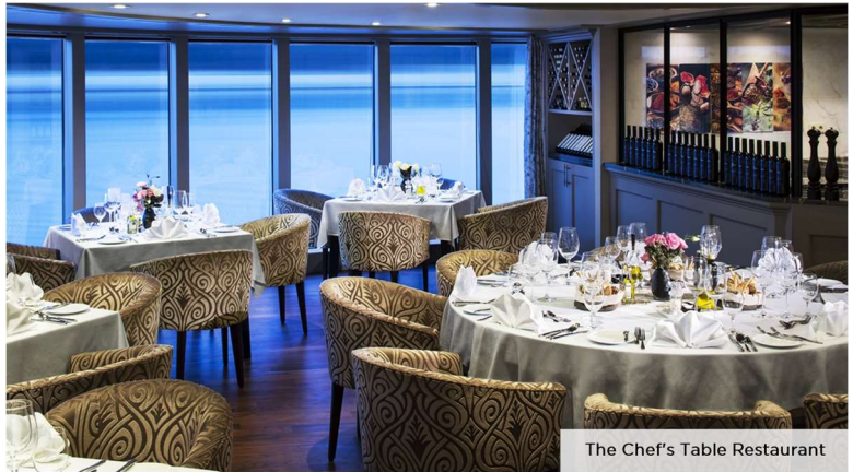
The Chef's Table Restaurant