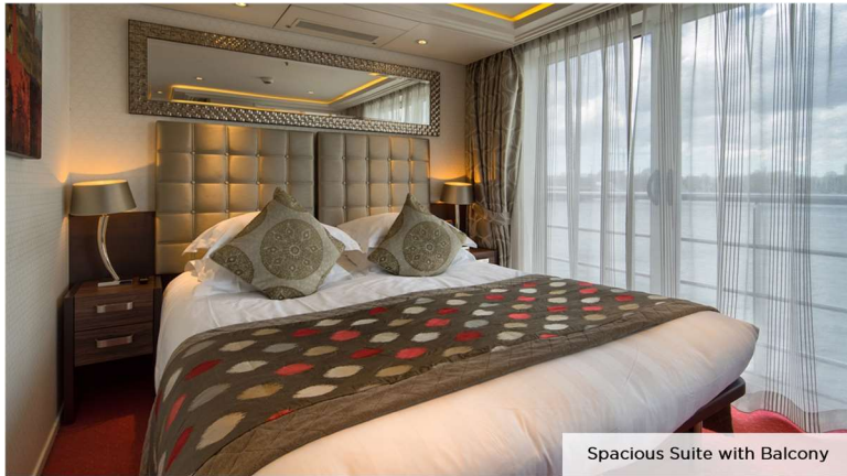
Spacious Suite with Balcony

7-night cruise | October 7-14, 2026 | Aboard AmaPrima